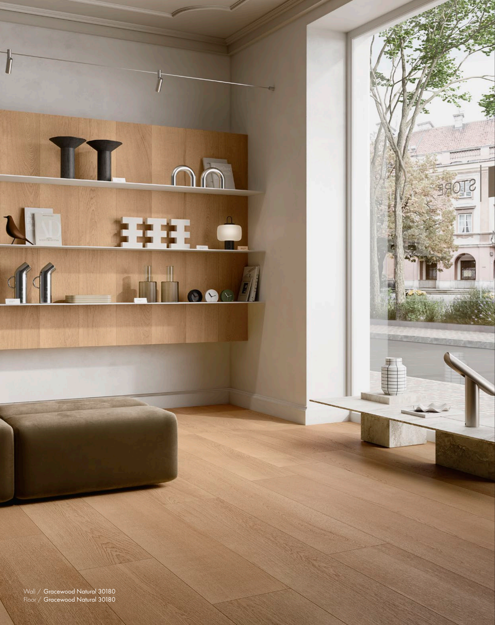
Wall / Gracewood Natural 30180 Floor / Gracewood Natural 30180