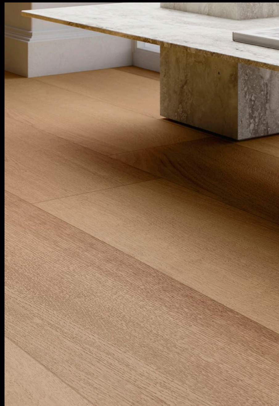
Gracewood Natural 30180