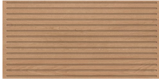
60x120 24"x48" Gracewood Deco Natural 60120