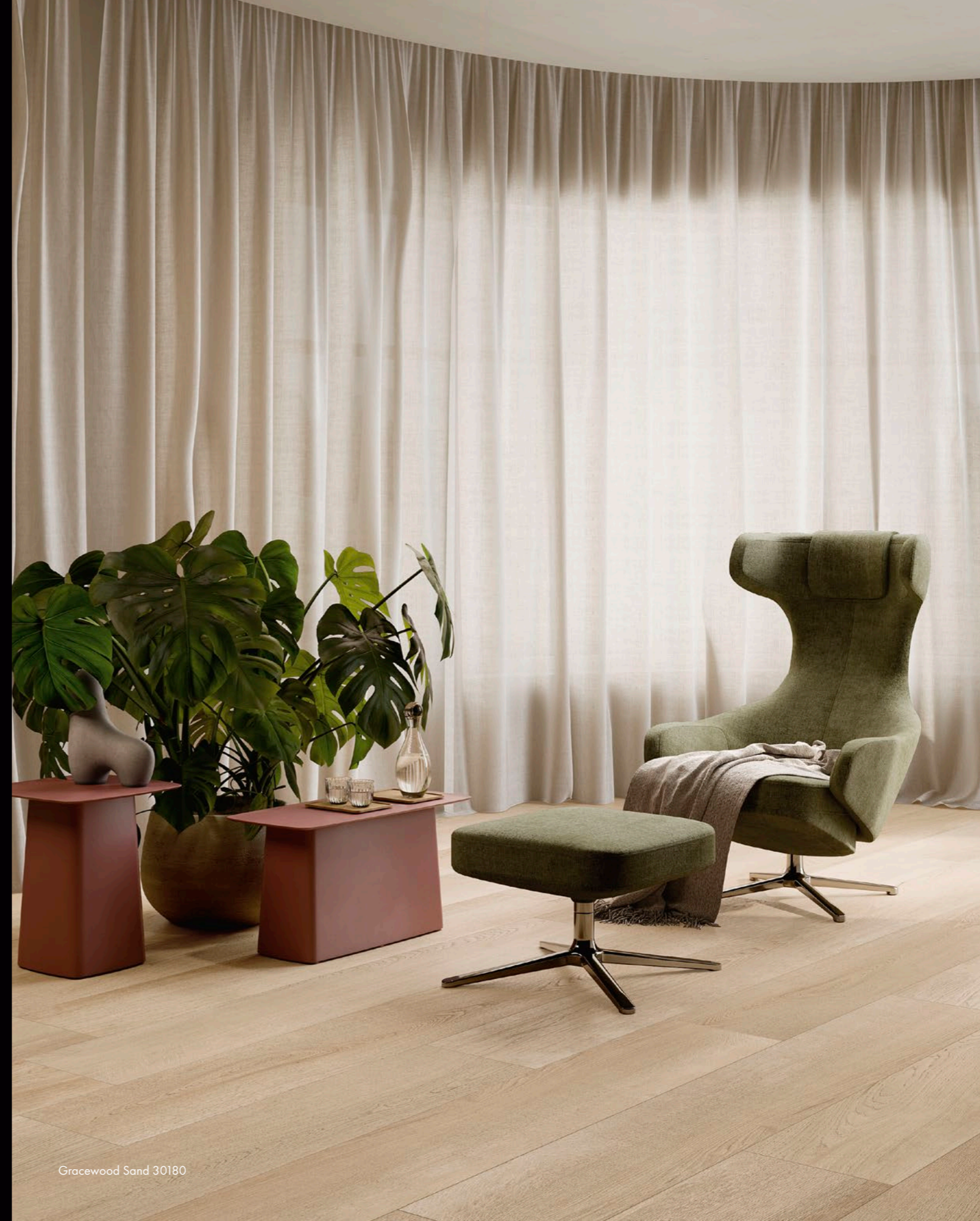
Gracewood Sand 30180