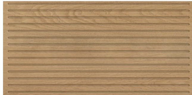
60x120 24"x48" Gracewood Deco Walnut 60120