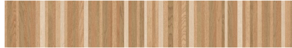
30x180 12"x72" Gracewood Mix 30180